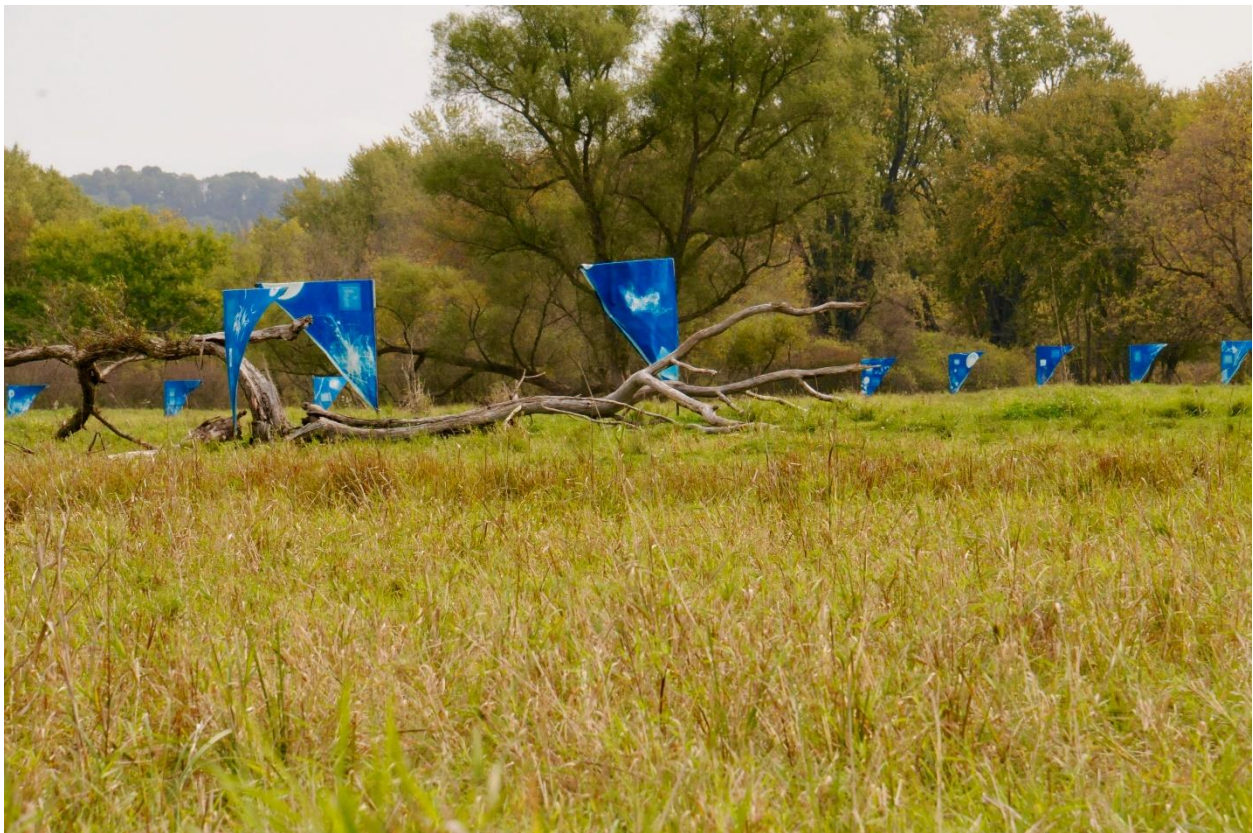
Reedsburg ArtsLink, FLUVIAL NORTH Reedsburg Arts Committee Grant Request 3/15/202